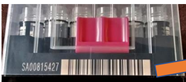
Rack ID bottom engraving section